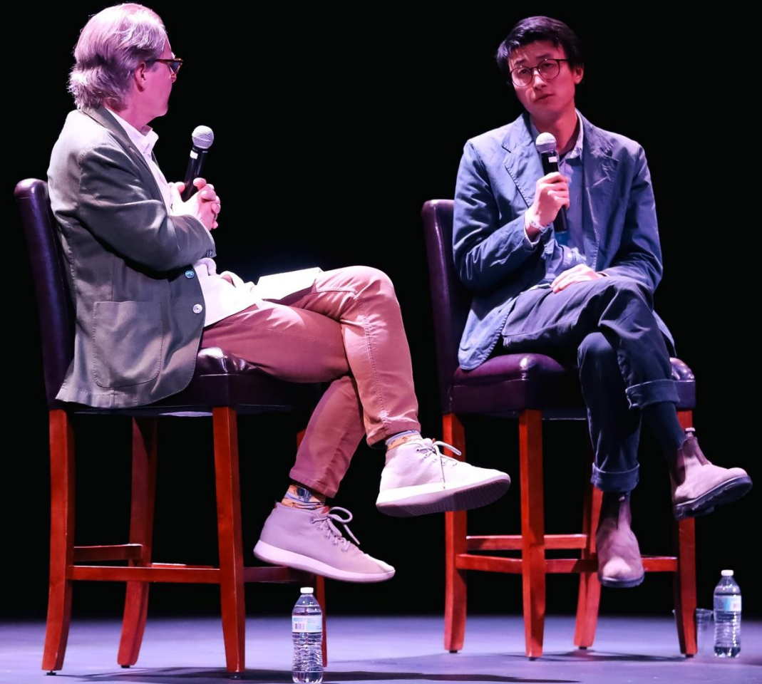
Bing Liu, Academy Award®-nominated filmmaker and Rockford native, headlined 815HORTS in 2023.